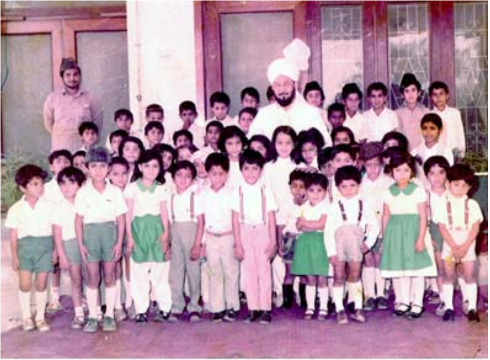
Hadrat Khalifatul-Masih IV rahimahullah with children.

Al-Hilal (Published by The Ahmadiyya Movement in Islam, U.S.A.) 15000 Good Hope Rd, Silver Spring MD 20905 Postmaster: Send address changes to P.O. Box 226, Chauncey, OH 45719