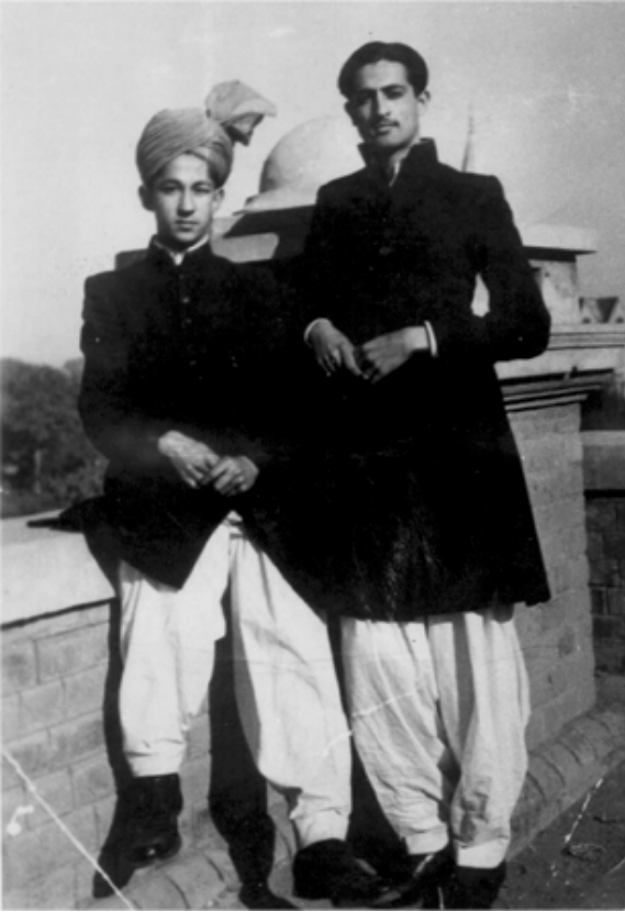
Young Sahibzadah Mirza Tahir Ahmad, later to be the Khalifatul-Masih IV, rahimahullah, seated on the left.

At last an uproar of cheers exploded after many long and wearisome hours. But those hours were all worth it: our Khalifa was chosen. Oh, how happy we were! Tears of joy dripped from our faces as his name was announced: Hadrat Mirza Masroor Ahmad, the fifth successor of the Promised Messiah (‘alaihiassalam).