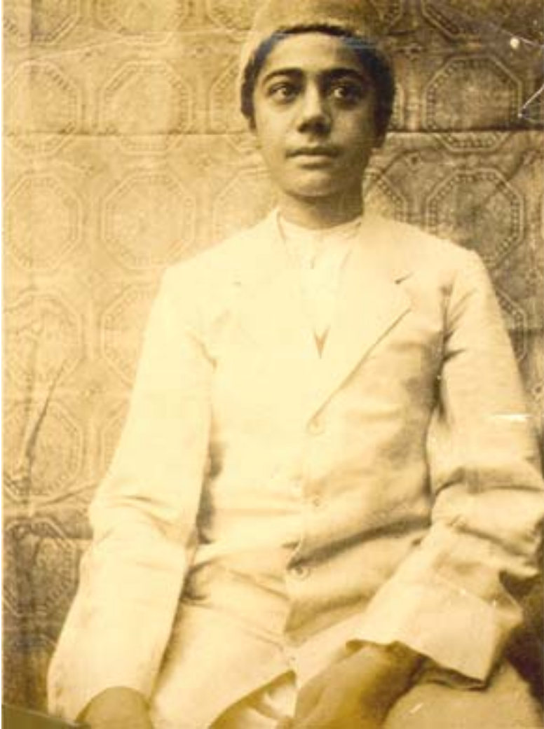
Hadrat Mirza Nasir Ahmad, Khalifatul-Masih III, rahimahullahu ta'ala, in his younger years.