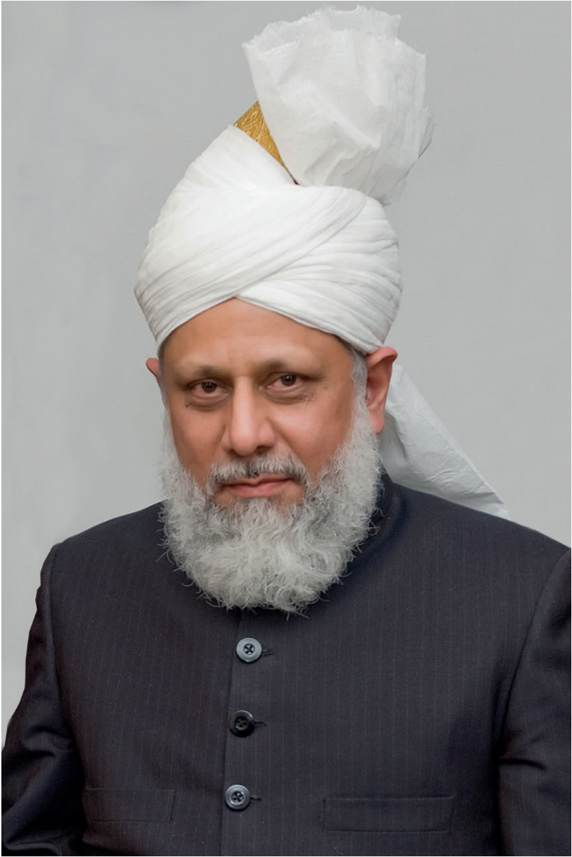
HIS HOLINESS HAZRAT MIRZA MASROOR AHMAD KHALIFATUL-MASIH V ABA