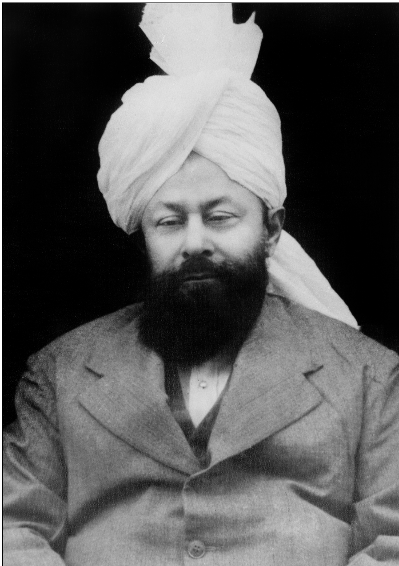
HAZRAT MIRZA BASHIR-UD-DEEN MAHMUD AHMAD, SECOND SUCCESSOR OF THE PROMISED MESSIAH, AND HEAD OF THE AHMADIYYAH COMMUNITY