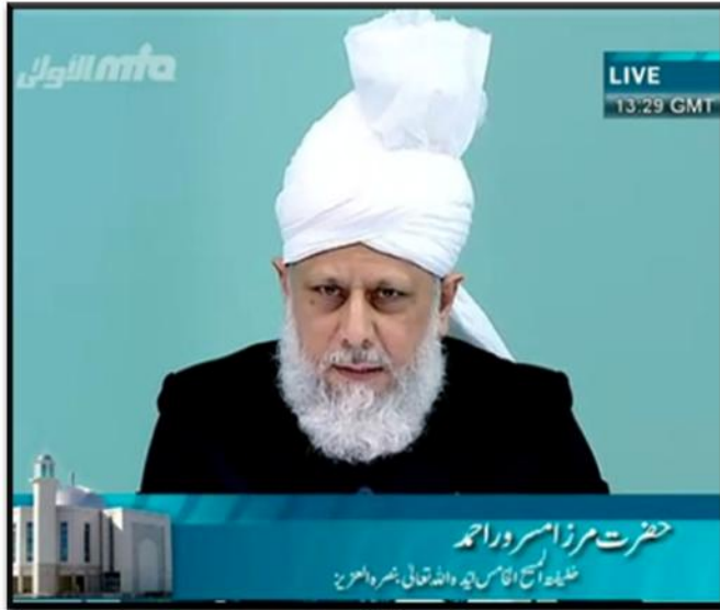
Sermon Delivered by Hadhrat Mirza Masroor Ahmad (aba); Head of the Ahmadiyya Muslim Community