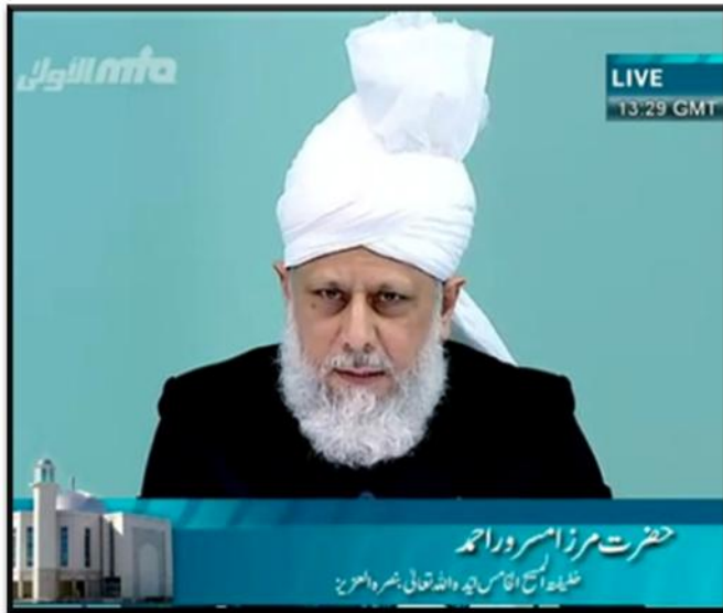
Sermon Delivered by Hadhrat Mirza Masroor Ahmad (aba); Head of the Ahmadiyya Muslim Community