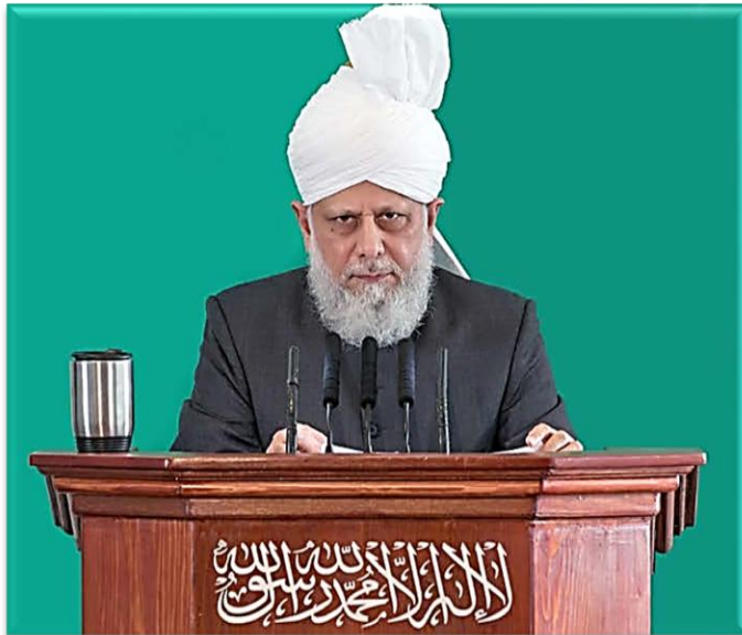
Sermon Delivered by Hadhrat Mirza Masroor Ahmad (aba); Head of the Ahmadiyya Muslim Community