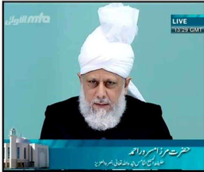
Sermon Delivered by Hadhrat Mirza Masroor Ahmad (aba); Head of the Ahmadiyya Muslim Community