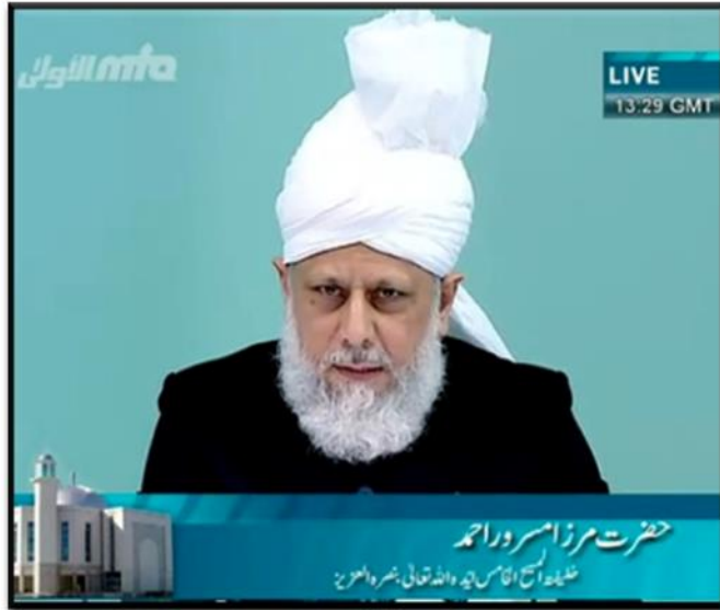
Sermon Delivered by Hadhrat Mirza Masroor Ahmad (aba); Head of the Ahmadiyya Muslim Community