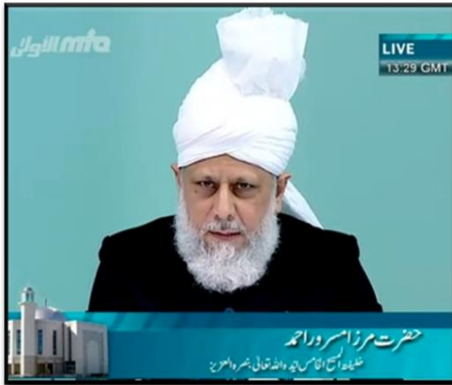
Sermon Delivered by Hadhrat Mirza Masroor Ahmad (aba); Head of the Ahmadiyya Muslim Community