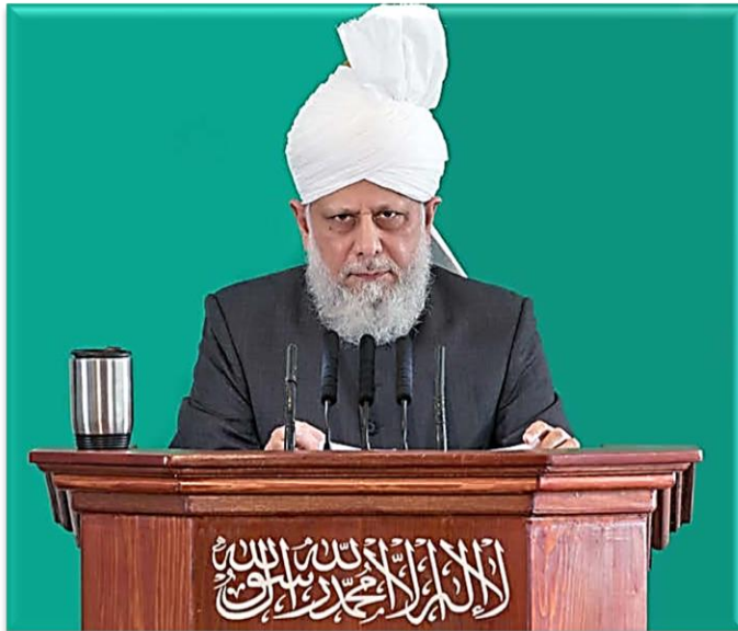
Sermon Delivered by Hadhrat Mirza Masroor Ahmad (aba); Head of the Ahmadiyya Muslim Community