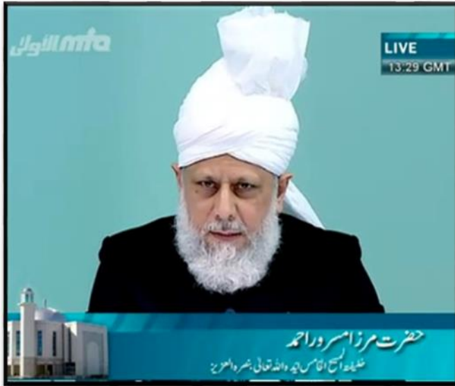
Sermon Delivered by Hadhrat Mirza Masroor Ahmad (aba); Head of the Ahmadiyya Muslim Community