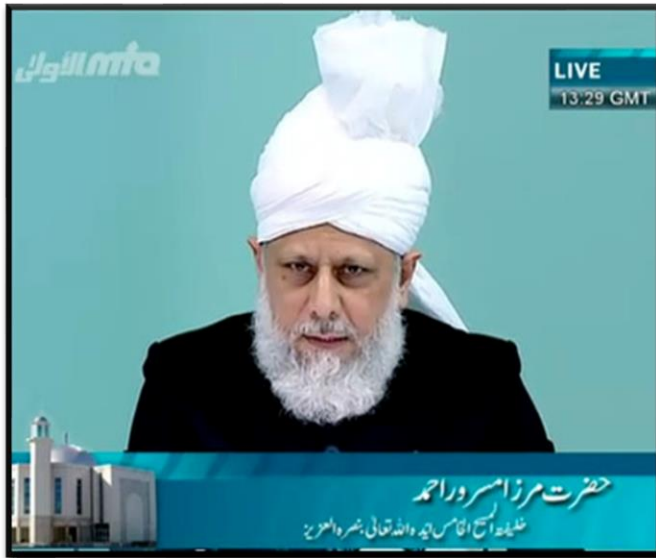
Sermon Delivered by Hadhrat Mirza Masroor Ahmad (aba); Head of the Ahmadiyya Muslim Community