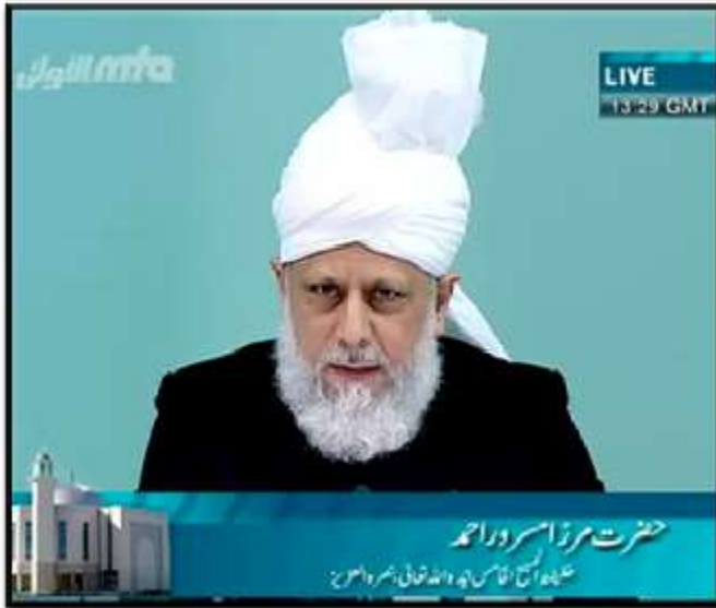
Sermon Delivered by Hadhrat Mirza Masroor Ahmad (aba); Head of the Ahmadiyya Muslim Community