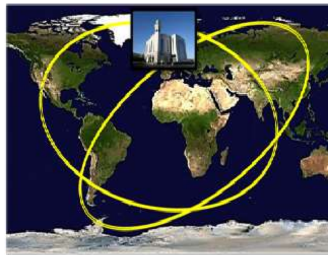
relayed live all across the globe