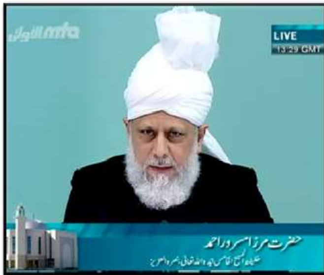
Sermon Delivered by Hadhrat Mirza Masroor Ahmad (aba); Head of the Ahmadiyya Muslim Community