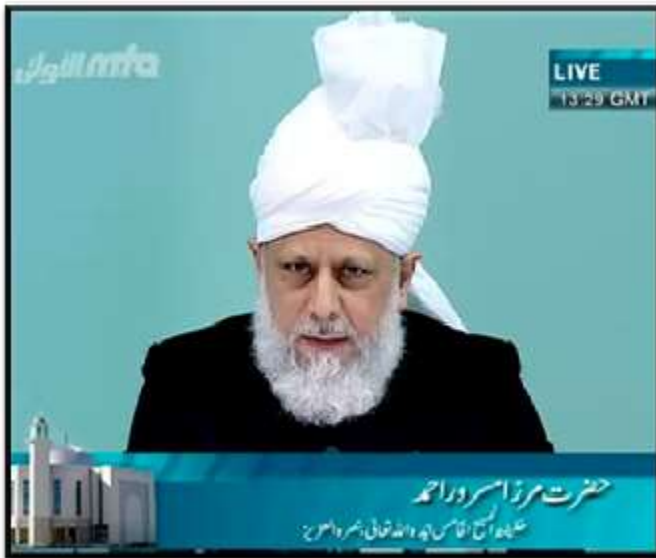
SERMON DELIVERED BY HADHRAT MIRZA MASROOR AHMAD (ABA); HEAD OF THE AHMADIYYA MUSLIM COMMUNITY