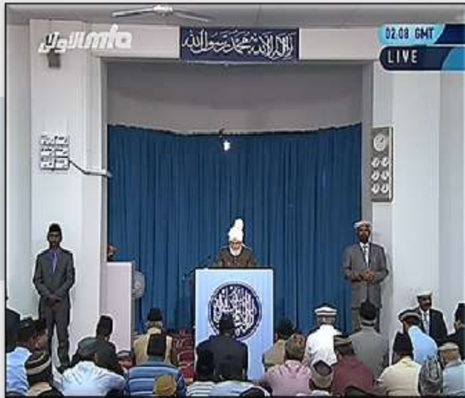
SERMON DELIVERED BY HADHRAT MIRZA MASROOR AHMAD (ABA); HEAD OF THE AHMADIYYA MUSLIM COMMUNITY