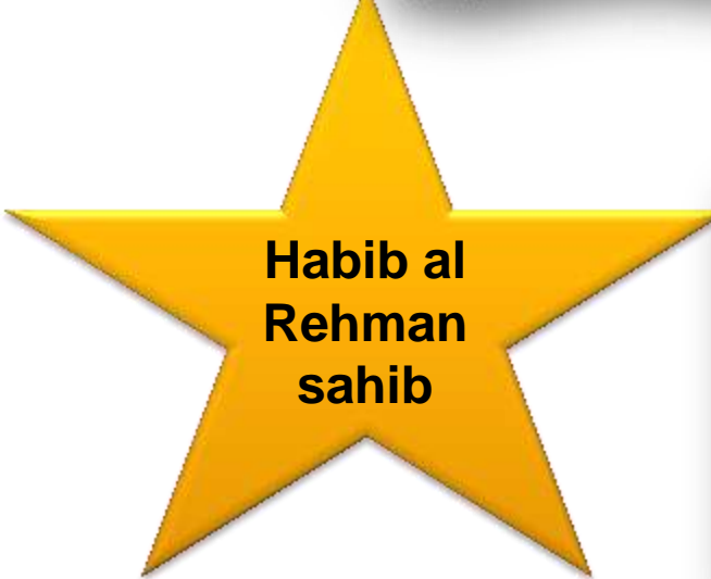
Habib al Rehman sahib