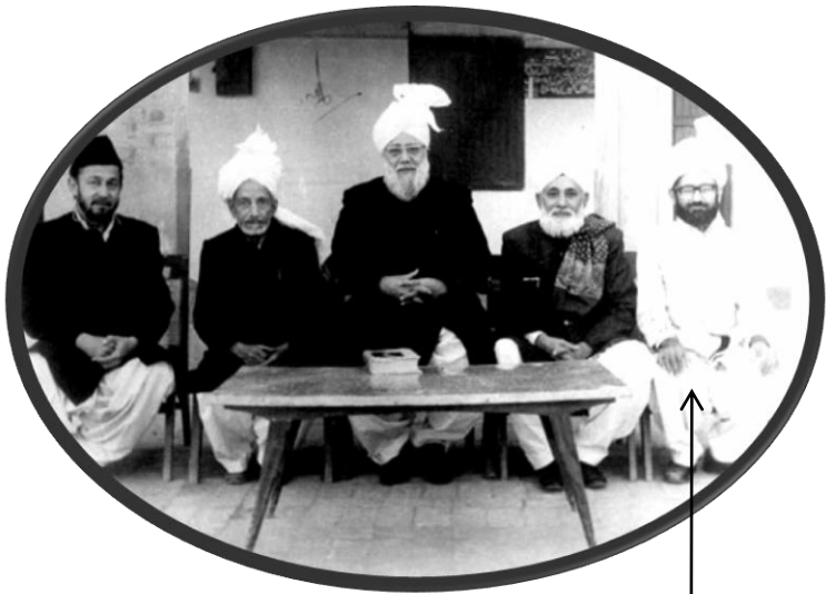
The members of the board who represented Ahmadiyya views to The National Assembly of Pakistan in 1974